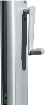
Bi-directional winder handle