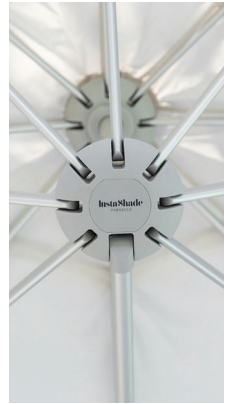
Strengthened rib profile