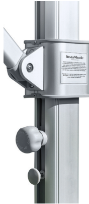
Easy glide slider car