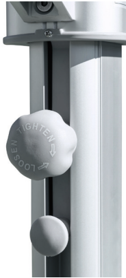
Infinity tilt system